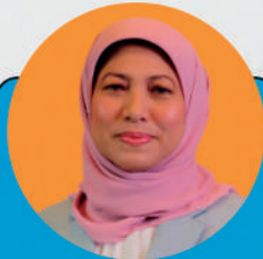
Yang Berhormat Dato' Sri Hajah Nancy Shukri

Minister of Women, Family and Community Development, Malaysia